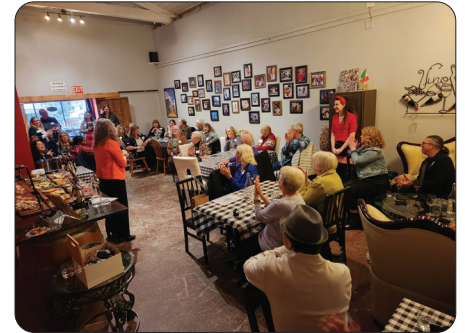
2024 Answers Uncorked at Salud Wine Bar