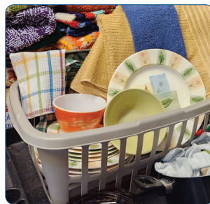
Welcome Home Kit example.

For a list of management staff, visit sharevancouver.org .