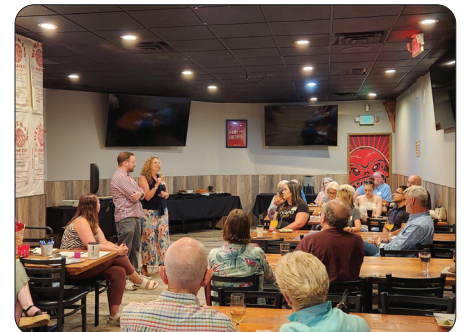
2024 Answers on Tap at Heathen Brewing Feral Public House