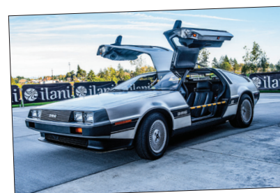
Yes! We had a DeLorean!