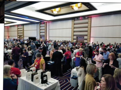
Grateful to the dozens of volunteers who helped our guests navigate the soup tasting line.