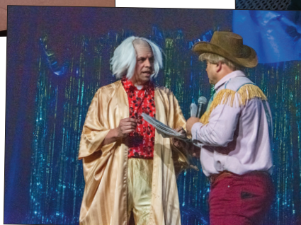
'Doc' and 'Marty' helped to tell the story of Share's 40 years of service to those in need in our community.